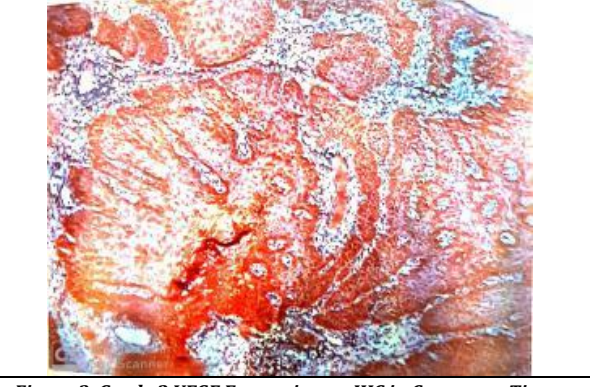
Figure 3. Grade 2 VEGF Expression on IHC in Cancerous Tissue

Figure 2. Grade 1 VEGF Expression on IHC in Cancerous Tissue