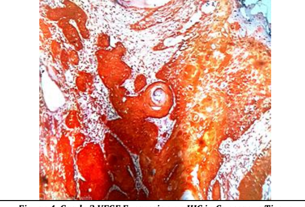
Figure 4. Grade 3 VEGF Expression on IHC in Cancerous Tissue